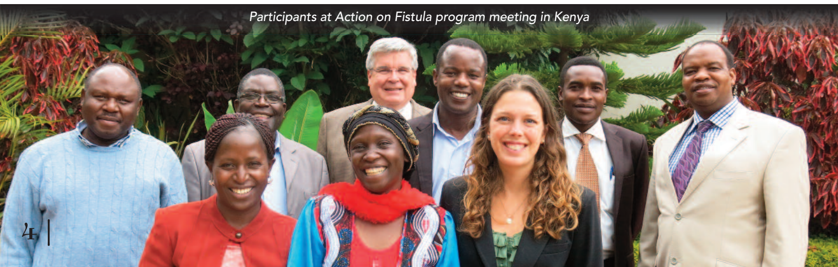
Participants at Action on Fistula program meeting in Kenya