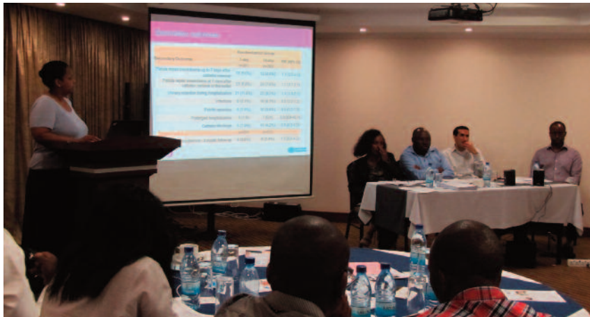
Fistula experts review progress of the FIGO surgery training program.

On June 25, 2014, FIGO convened a meeting in Dar es Salaam, Tanzania to review the progress of its fistula surgery training program. The program is based on the 'Global Competency-Based Fistula Surgery Training Manual' which was developed by FIGO and launched in 2011. The manual was established as a standardized training curriculum and set of fistula treatment and care guidelines that are being used to train surgeons around the world.