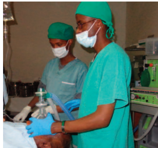
New anesthesia machine in action at National Boroma Fistula Hospital in Somaliland