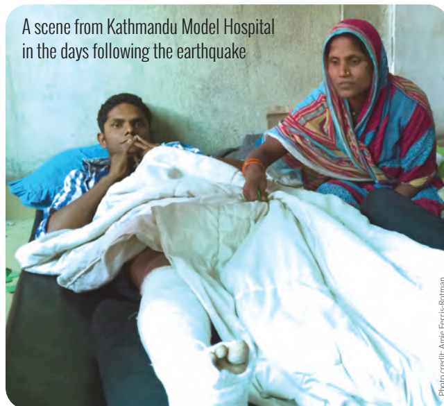
A scene from Kathmandu Model Hospital in the days following the earthquake