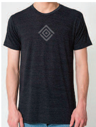
Fistula Logo Tee

These soft and comfy tees allow you to spread the word about obstetric fistula in style! Sizes S-XXL.